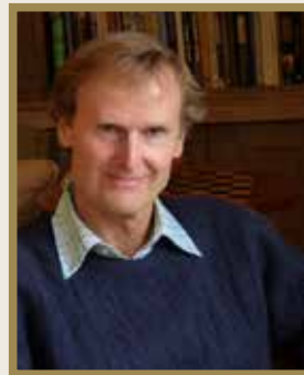
Ralph Percy, 12th Duke of Northumberland

“Alnwick Castle is very special to my family, it has been our home for centuries and has hosted wonderful celebrations that have made many fond memories for us. I am therefore delighted that you are considering the castle as the venue for your own special day, its history and magnificent architecture make it a truly remarkable venue. We wish you every happiness for your future together.”